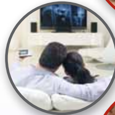
Movies, music & TV