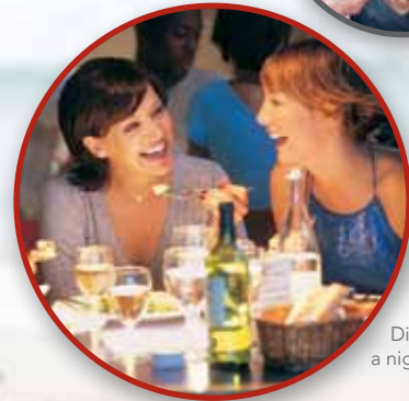
Dinner and a night out with friends